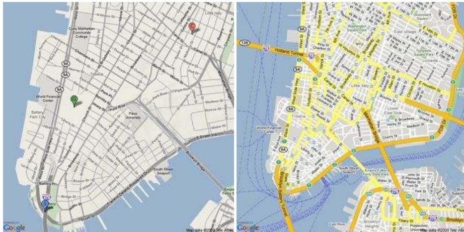
Figure 1: (a) Static map with markers, (b) Static (mobile) map