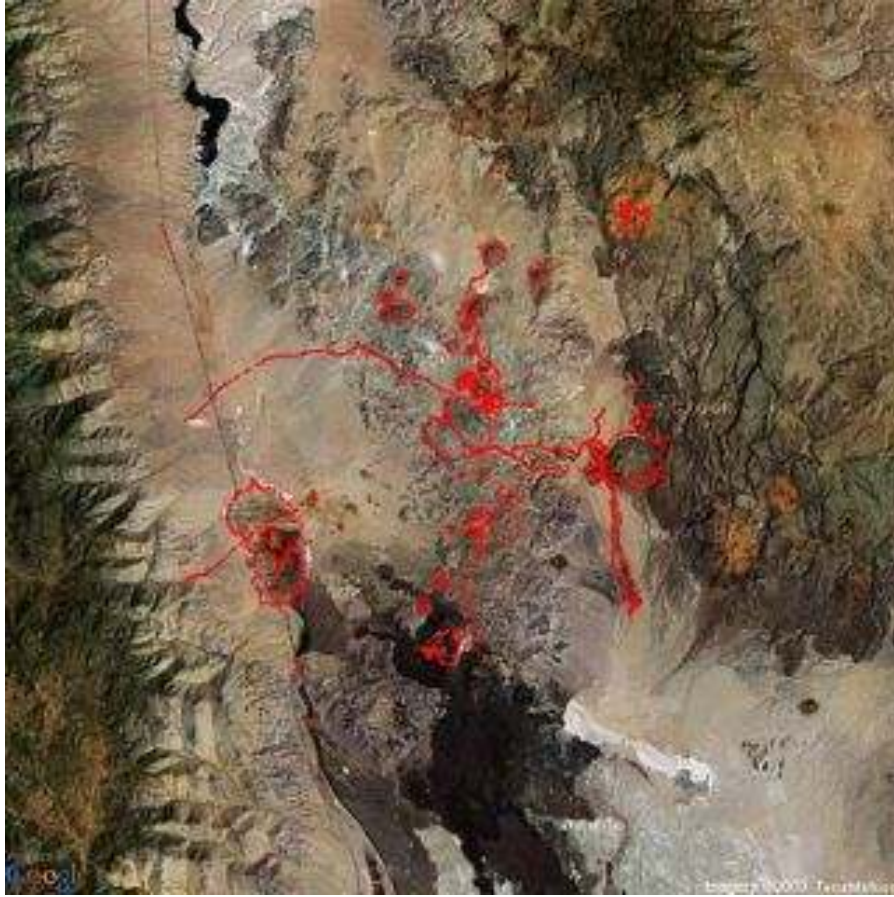
Figure 4: Coso Geothermal Region Faults

same static map, the user most likely does not want to request the same map over and over again. By setting NEWMAP = F in GetMap.bbox() the function itself reads the map straight from the file specified by destfile . Furthermore, in order to not repeatedly read the map from a file, it can be stored and passed to most functions in the list MyMap that additionally contains information on the zoom level and the center.